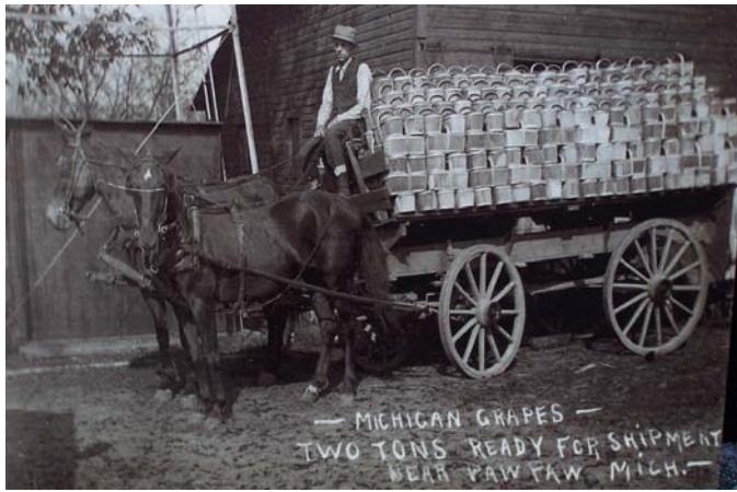
Grape baskets loaded with freshly-picked grapes ready for shipment.

before the 18 th Amendment banned alcoholic beverages in all states in the union. The 18 th Amendment was ratified in 1919 and the ban of alcohol became effective January 16, 1920 – the rollicking era of Prohibition arrived.