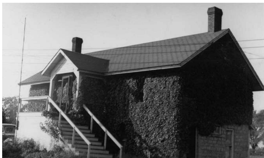
Pointe Aux Peaux winery

In 1870, a two-story winery was erected after three years of construction. It was built from limestone brought by vessel from Sandusky, Ohio. An air chamber left between the exterior stone wall and the interior brick wall enabled the winemakers to maintain year-round