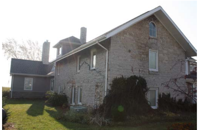
The old Pointe Aux Peaux winery building is now seamlessly connected to a modern lake house.

The 1884 state census indicated that 24,685 gallons of wine were produced in Michigan. Of the 3,228 acres of vineyards, 1,550,702 pounds of grapes were sold. Notably, half of the wine production was in Monroe County. 36