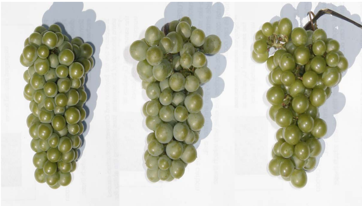
Figure 2. Visual expression of within cluster compactness differences.